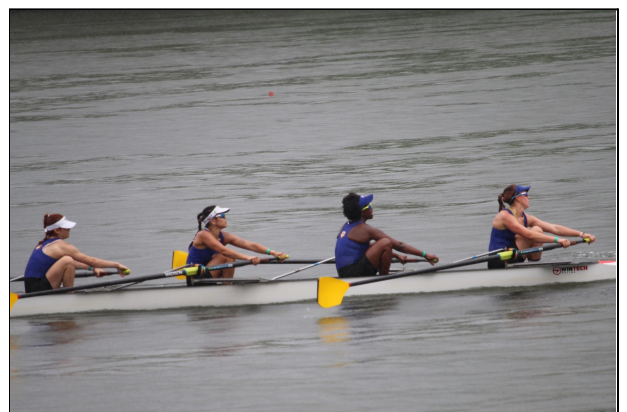
Varsity women's 4+ wins petite final by open water.